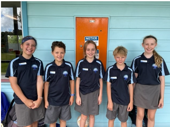
Congratulations to our School leaders for 2023.